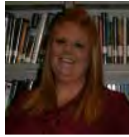
Lindey Skaggs Elementary